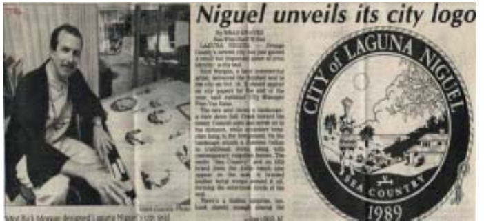
City Logo Article

Local teachers and staents now have easy access